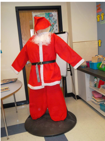
Where is Santa in our school ?